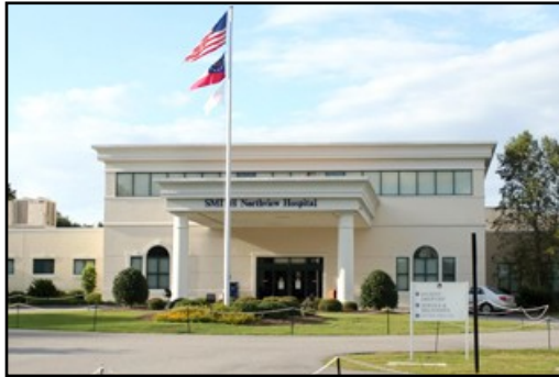
SMITH Northview Hospital's current facility opened in 2002.